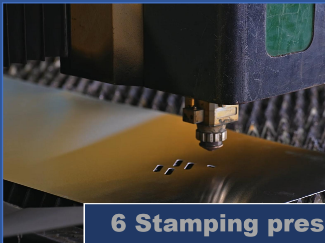
6 Stamping press machine