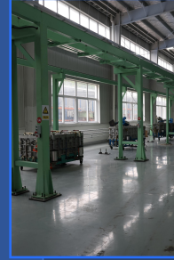
7 Body Foaming Line