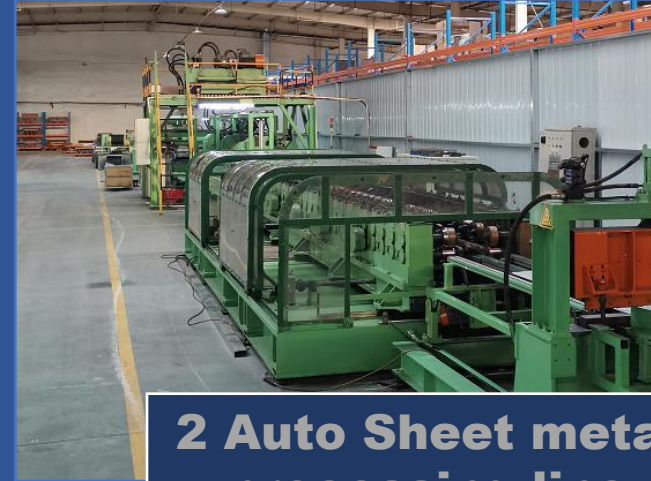
2 Auto Sheet metal processing line