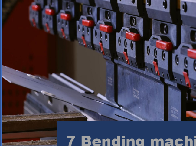
7 Bending machine