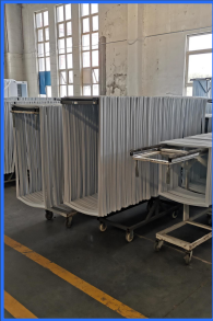
2 Door Gasket production Line