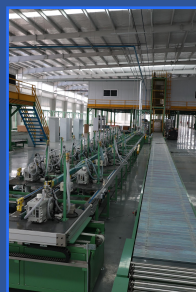
1 Fully Automated Production Line Under Construction