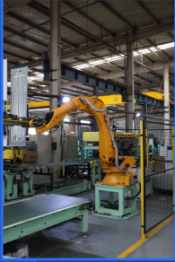
7 Pre Assembly Line