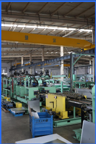
1 Flexible Manufacturing Line