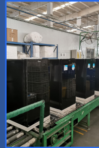
4 Final Assembly Line