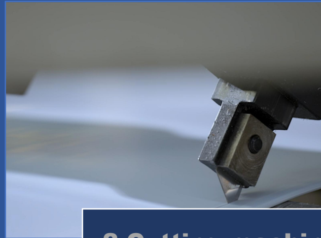
2 Cutting machine